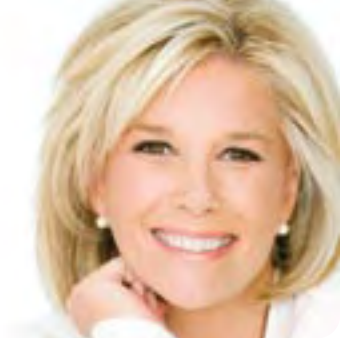
Joan Lunden, Age 57

"My skin looks better now than it has in 10 years"